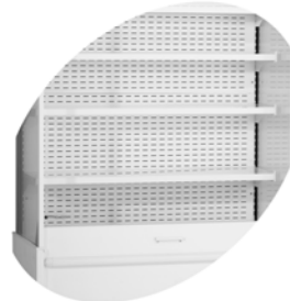
Adjustable shelves with tilting function