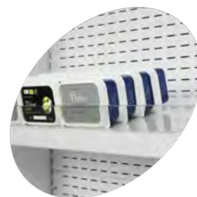
Adjustable shelves with tilting function