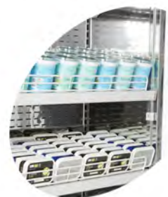
Adjustable shelves with tilting function