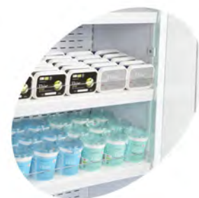
Adjustable shelves with tilting function