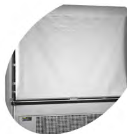
Soft release night blind / curtain