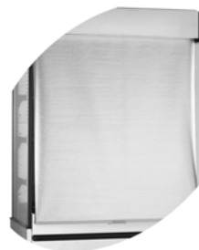
Soft release night blind / curtain