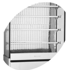
Adjustable shelves with tilting function