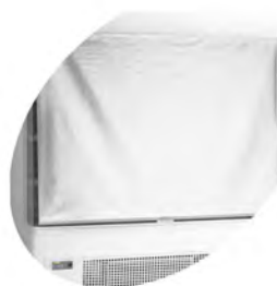
Soft release night blind / curtain