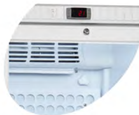
Thermostat with audible and external alarm