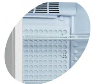
Evaporator cover preventing damaged medicine