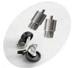
Wheels or adjustable legs as option