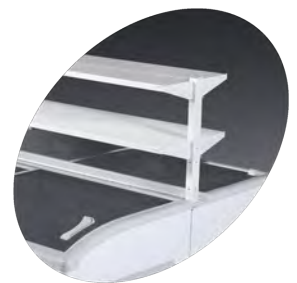
Promotional shelves as accessory