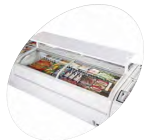
Shelf as accessory