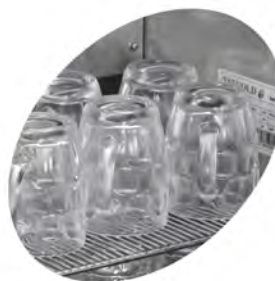
Perfect served tapped beer in frosted glasses