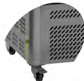
Castors with and without brake